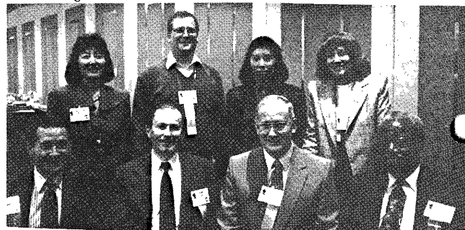
1991 - Executive Committee