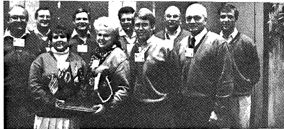
General Conference Committee