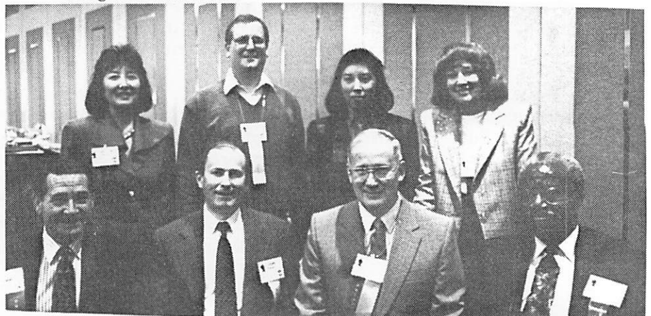
1991 - Executive Committee