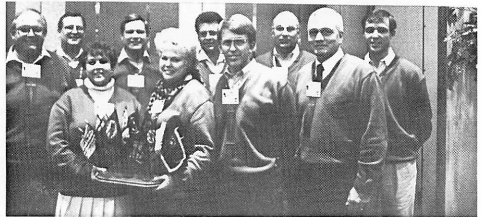
General Conference Committee