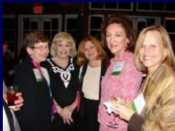
New York 2006