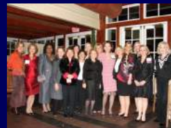
New York 2006