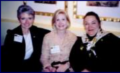
San Francisco 2004