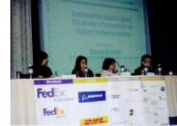
San Francisco 2004