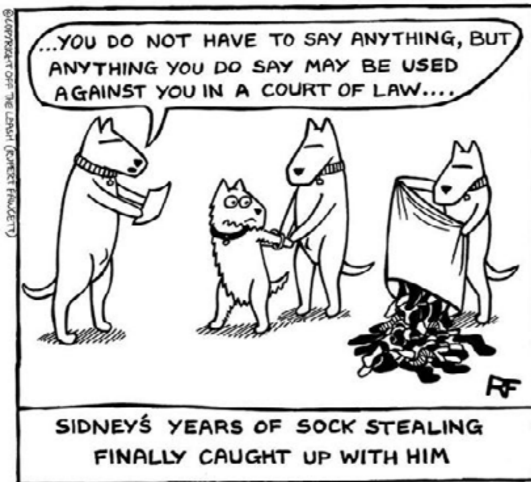
FACEBOOK.COM/OFF THE LEASH DAILY DOG CARTOONS