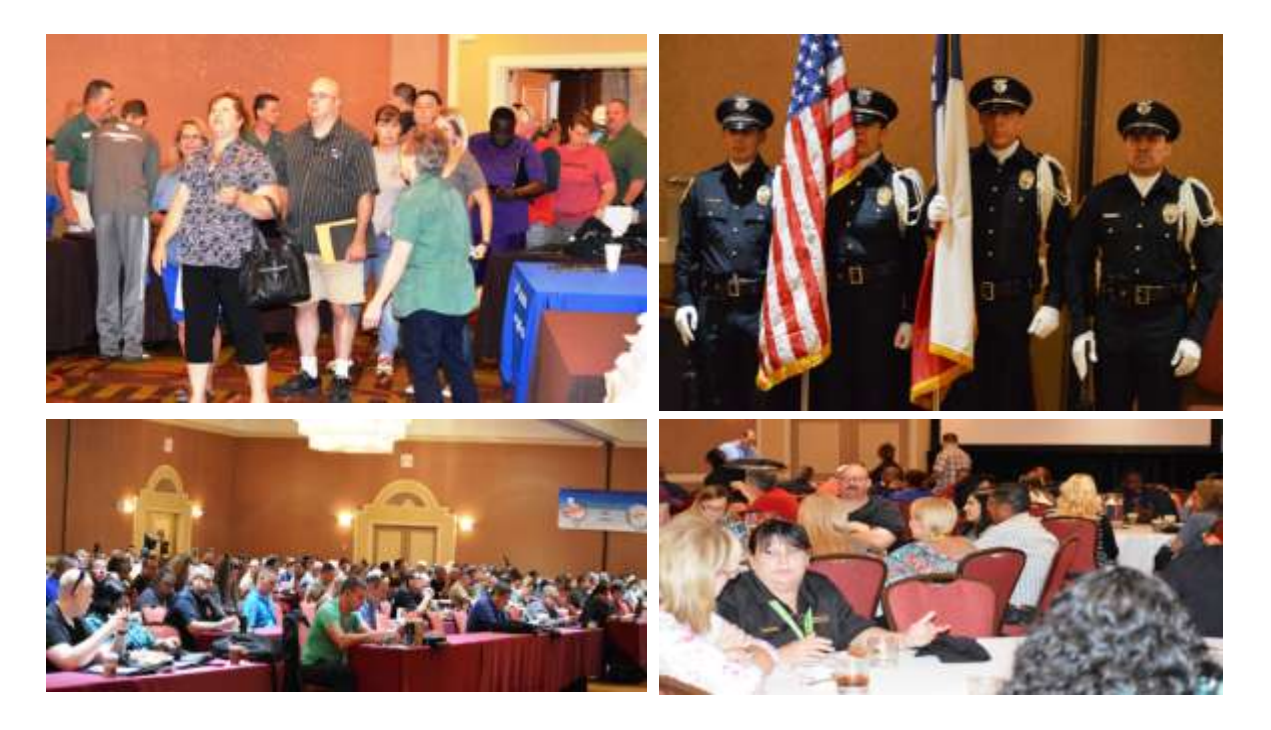
TAPEIT 2016— San Antonio, TX Just some of the photos... see more at www.tapeit.net

Thank you to all of the members who made the 2016 conference great!